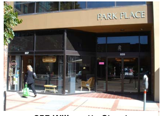
857 Willamette Street 644 Square Feet