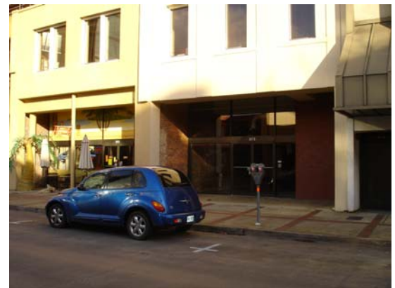
873 Willamette Street 2,085 Square Feet